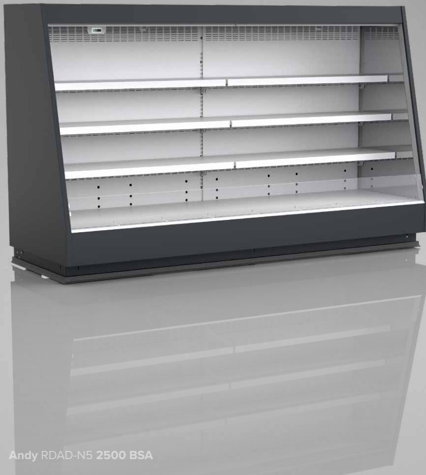
Andy RDAD-N5 2500 BSA

DBS – door | double, bent | sliding (sideways) DDS – door | double, straight | sliding (sideways)