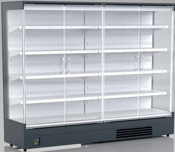
Garmo RDGA-L5 2500 DVO

DVO – door | double, straight (High Vision) | hinged DDS – door | double, straight | sliding (sideways)