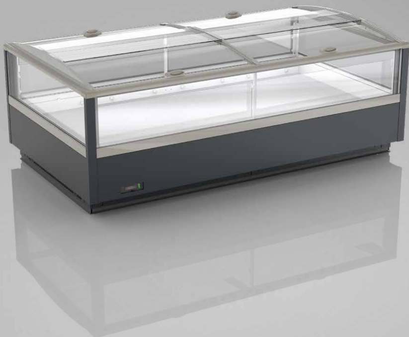
Idea WNID-04 2500 CCP

CCP – cover | single, curved | sliding (slide-up/push)