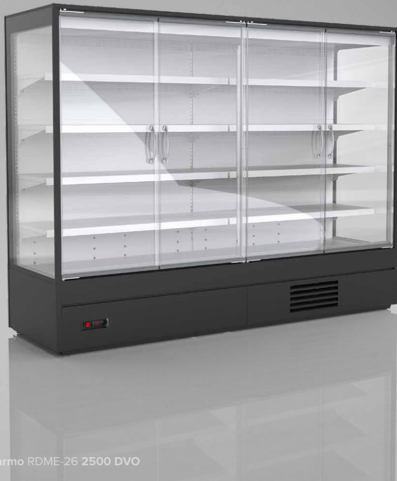
Garmo RDME-26 2500 DVO

DVO — door | double, straight (High Vision) | hinged BSA — low glass or front glass riser | single, straight | fixed